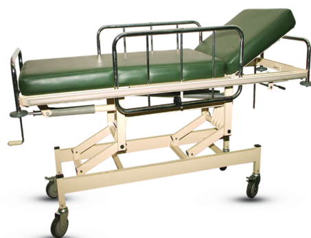
SF-H-003 Stretcher Trolley