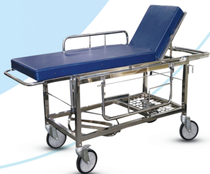
SF-H-001 Stretcher Trolley