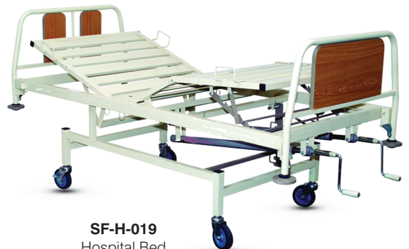
SF-H-019 Hospital Bed