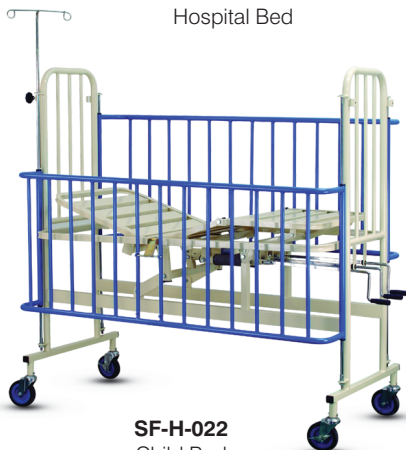
SF-H-022 Child Bed