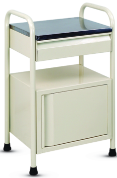
SF-H-055 Bed Side Lockers