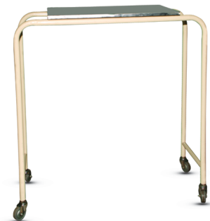
SF-H-035 Over The Bed Meal Tables