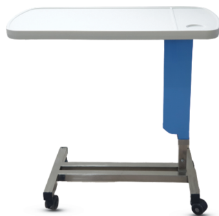
SF-H-033 Over The Bed Meal Tables