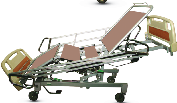
SF-H-020 Hospital Bed