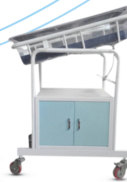
SF-H-040 Baby Cot