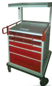
SF-H-061 Crash Carts