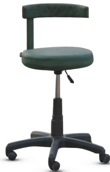
SF-H-047 Clinical Stools