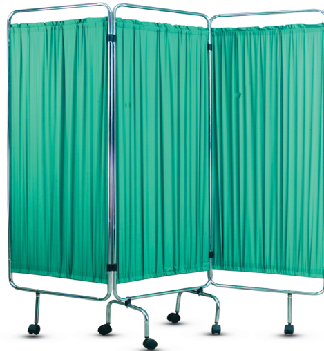
SF-H-064 Patient Privacy Screen