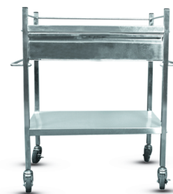
SF-H-008 Ward Trolley