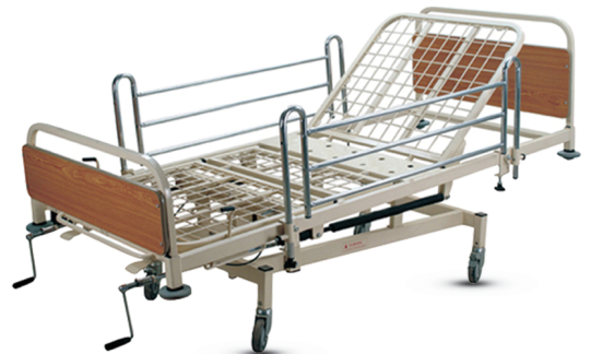
SF-H-021 Hospital Bed