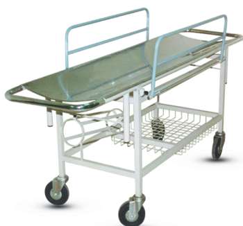
SF-H-004 Stretcher Trolley