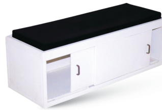
SF-H-044 Attendant Bench