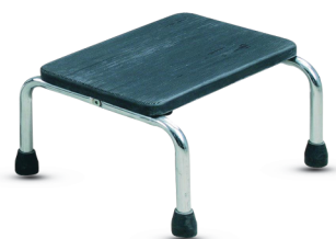
SF-H-054 Patient Foot Steps