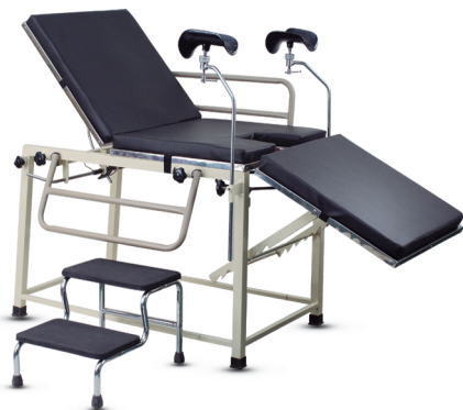
SF-H-027 Delivery Table