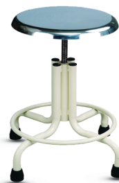
SF-H-049 Clinical Stools