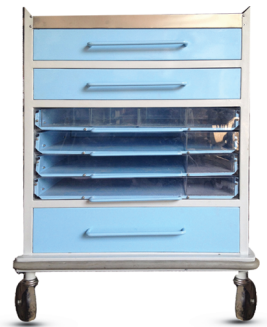
SF-H-059 Medicine Cart