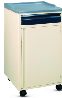
SF-H-058 Bed Side Lockers