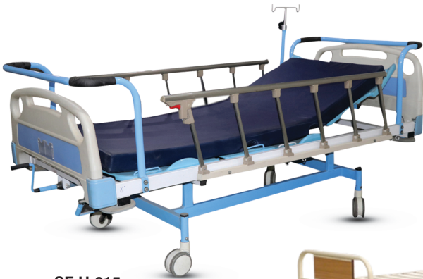
SF-H-015 Hospital Bed