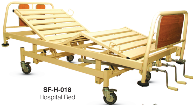
SF-H-018 Hospital Bed