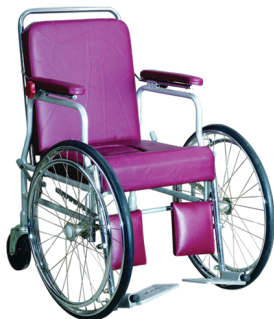
SF-H-062 Wheel Chairs