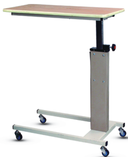
SF-H-032 Over The Bed Meal Tables