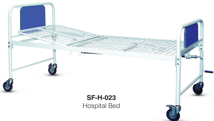
SF-H-023 Hospital Bed