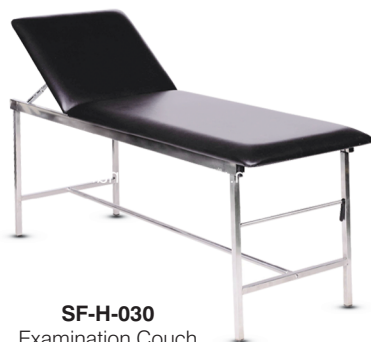
SF-H-030 Examination Couch