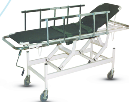
SF-H-002 Stretcher Trolley