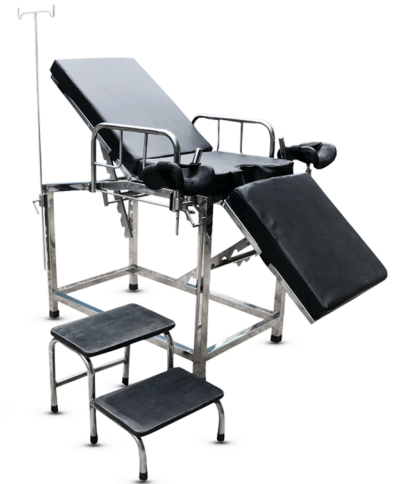
SF-H-026 Delivery Table