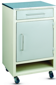
SF-H-056 Bed Side Lockers