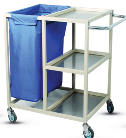
SF-H-010 Linen Handling Trolley