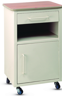
SF-H-057 Bed Side Lockers