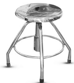
SF-H-050 Clinical Stools