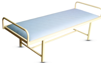
SF-H-043 Attendant Bed