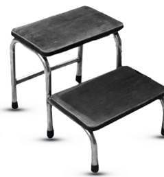
SF-H-053 Patient Foot Steps