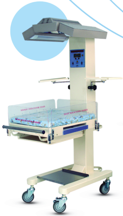
SF-H-036 Baby Warmers