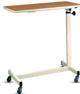
SF-H-034 Over The Bed Meal Tables