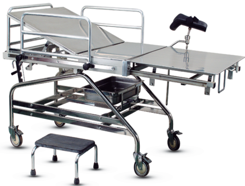
SF-H-024 Delivery Couch