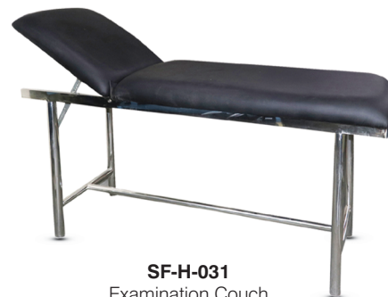
SF-H-031 Examination Couch