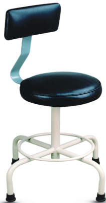
SF-H-046 Clinical Stools