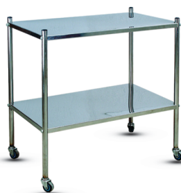
SF-H-007 Instrument Trolley