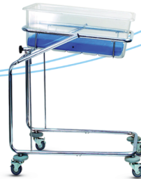
SF-H-039 Baby Cot