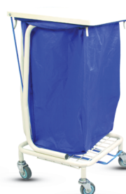
SF-H-012 Linen Handling Trolley