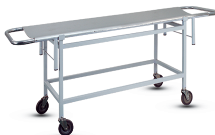
SF-H-005 Stretcher Trolley