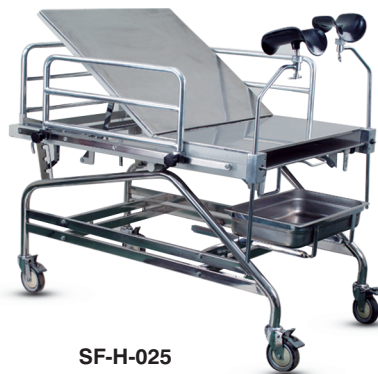
SF-H-025 Delivery Couch