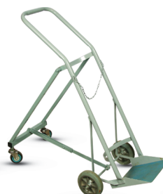
SF-H-013 Cylinder Trolley