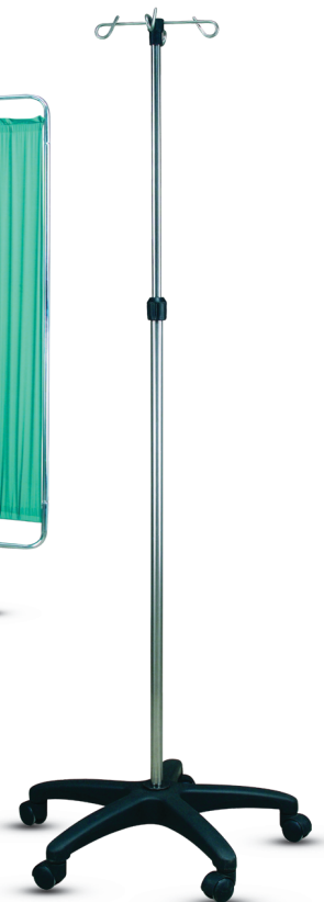
SF-H-065 I.V stand