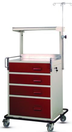
SF-H-060 Crash Carts