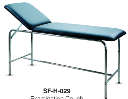
SF-H-029 Examination Couch