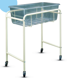
SF-H-041 Baby Cot