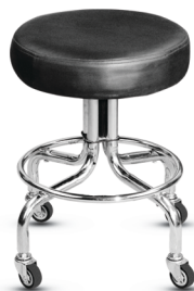
SF-H-048 Clinical Stools