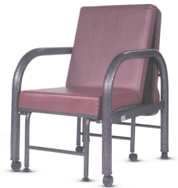
SF-H-045 Attendant Bench