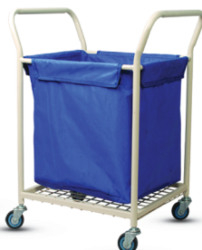
SF-H-011 Linen Handling Trolley