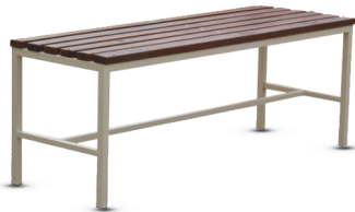
SF-H-042 Attendant Bench