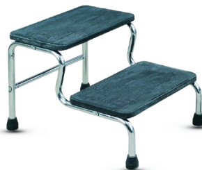
SF-H-052 Patient Foot Steps