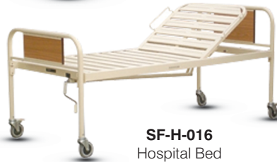
SF-H-016 Hospital Bed