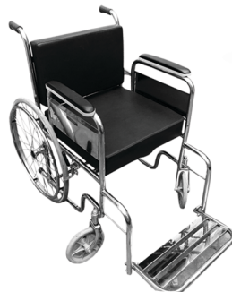
SF-H-063 Wheel Chairs