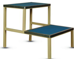
SF-H-051 Patient Foot Steps