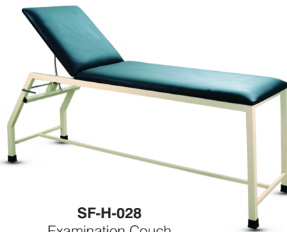
SF-H-028 Examination Couch