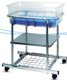
SF-H-038 Baby Cot