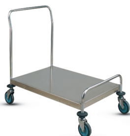
SF-H-009 Transport Trolley