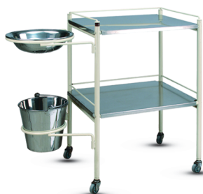
SF-H-006 Dressing Trolley